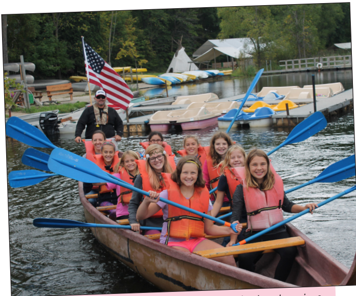
Students from Horace Mann Middle School enjoyed a unique outdoor learning experience for the second straight year at Camp Anokijig in Sheboygan County this fall. Students experienced a hands-on science curriculum and recreational activities during a two-day, one-night visit. Horace Mann students and staff had exclusive use of the facilities for the week. An anonymous donor provided $50,000 and pledged another $50,000 over five years to support the trip.

A wellness expo with various local organizations and businesses followed in the cafeteria. The entire staff returned to Pickard Auditorium afterwards for a showing of the film, Most Likely to Succeed , about the future of education in the 21st century and the importance of teaching critical skills needed for the workforce rather than just memorization of information.