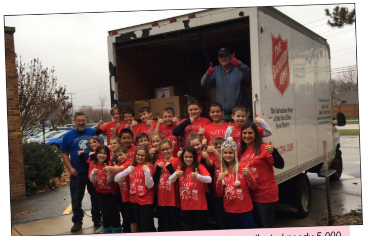
Students and families at Lakeview Elementary collected nearly 5,000 food and water items for the Salvation Army in its annual "Stuff the Turkey" event. This was the ninth year of the event and the amount collected was double the amount typically collected in past years.