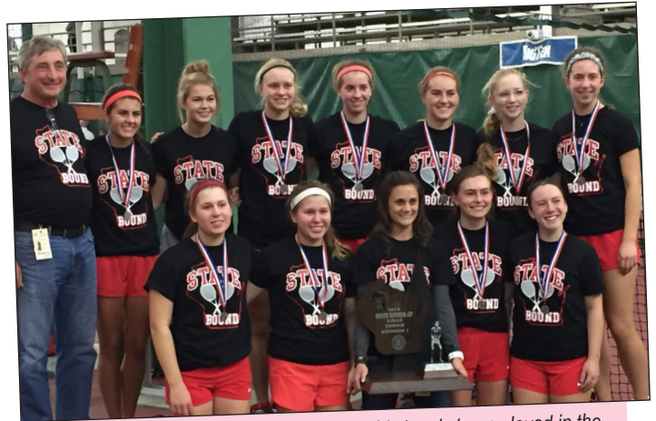
For the third straight year, Neenah's girls tennis team played in the state championship match. The Rockets placed runner-up with a 4-3 loss to Homestead in the final and finished with a 15-4 season record. Neenah won the state title in 2015 and was runner-up in 2014.