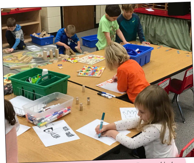
Neenah 4K students learn concepts in all core subject areas, fine and gross motor skills, social skills and routines and expectations of the school experience. About 345 students are enrolled in the second-year 4K program.

Even the best of expectations couldn't have predicted the early success of the Neenah Joint School District's four-year-old kindergarten (4K) program, which began its second year in 2016-17.