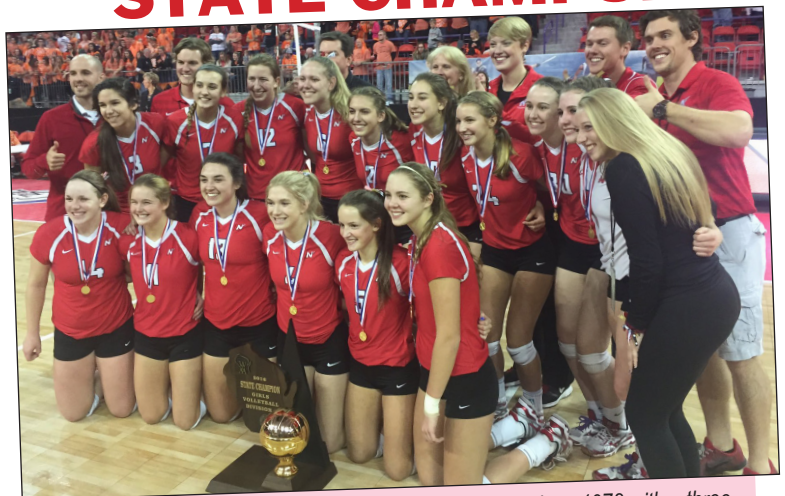
Neenah's girls volleyball team won its first state title since 1978 with a three-set sweep of Burlington on Nov. 5. The Rockets finished 46-4 for the season and are ranked No. 23 in the USA Today national high school rankings.