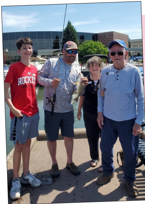
Several members of the Neenah High School fishing team and the Shattuck Middle School Finatics Club participated in a 'Memory Cafe' at the Neenah Public Library. Students paired up with participants and fished on the docks and shaded areas around the library and Shattuck Park with a goal of catching whatever was biting. Lots of sheepshead and catfish caught made it an exciting day.

The store features a wide range of apparel and other items.