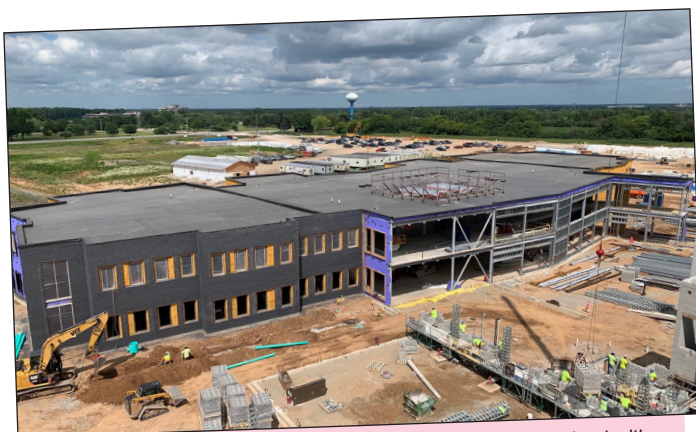
Construction is on schedule for the new Neenah High School with completion anticipated in July 2023. For more photos and details on the project, check out pages 4-5.

Alliance Charter Elementary School, which currently occupies in the Roosevelt building, will double in size and move into the Wilson Elementary building. Students currently attending Roosevelt and Wilson will attend Horace Mann Elementary School next fall.