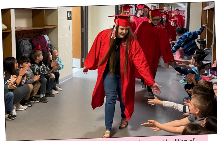
Neenah High School graduates continued a recent tradition of visiting their elementary schools for a celebration on the morning of Graduation Day. Current students lined the halls and clapped.