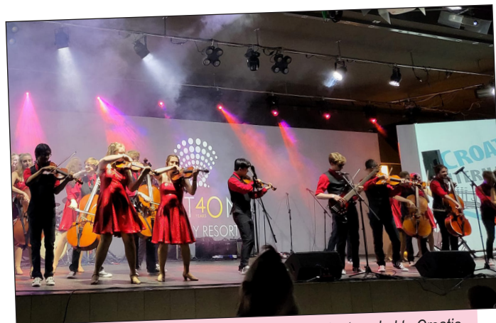
Neenah High School's Touch of Class orchestra traveled to Croatia in June. The group fundraised for the trip and performed with the Music City Strings from Nashville and the Caleb Chapman Soundhouse from Salt Lake City. They performed six shows throughout the Dalmatian region of Croatia and participated in clinics presented by top jazz professionals.