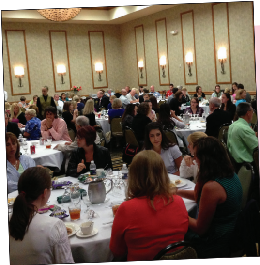
In an event unique to NJSD, new staff members were welcomed to the District with a luncheon on August 21 at Bridgewood Resort in Neenah.