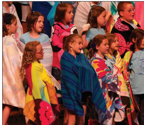
A summer choir program is one of several one-week learning opportunities for Neenah students during the summer.

One-week programs in different elective subject areas kept Neenah students busy during the summer.