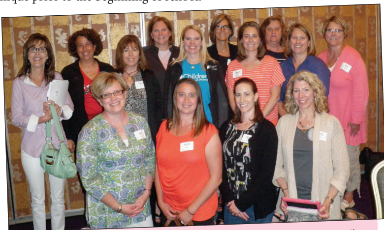
A team of 14 Neenah staff members who assist students on the autism spectrum attended a two-day conference this summer through the Wisconsin Department of Public Instruction.

Numerous staff members were involved in teaching and organizing various academies for students that were offered within the District this summer. The summer is also the busy time for operations and maintenance staff to get major projects completed before students return.