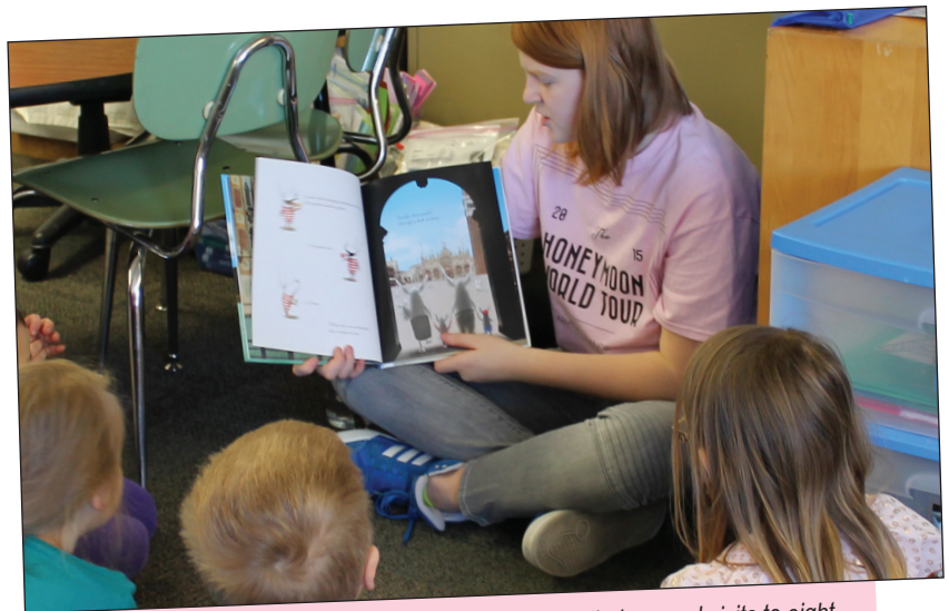
Horace Mann student council members made their annual visits to eight elementary schools in the District. The students brought favorite picture books from home to read to kindergarten through third grade students. In each classroom, the students were divided into small groups with a sixth grader reading to each group.

Alliances also earn points for building skyrisers on their skyrise base out of skyrise sections, and scoring cubes on skyrisers. A bonus is awarded to the Alliance that has the most total points at the end of the autonomous period.