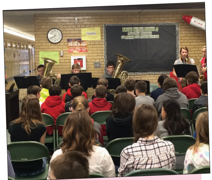
Students at Horace Mann Middle School were treated to music every morning during March as part of "Music in Our Schools Month." Students from schools throughout the District visited the school each day and performed in the lobby as students and staff arrived for the school day.