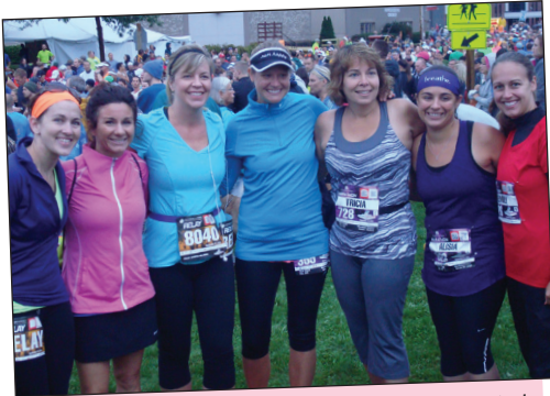
Lakeview Elementary staff members participated in Fox Cities Marathon events last fall.

Neenah Joint School District employees have made an added emphasis on wellness during the 2014-15 school year by participating in the Humana Vitality program.