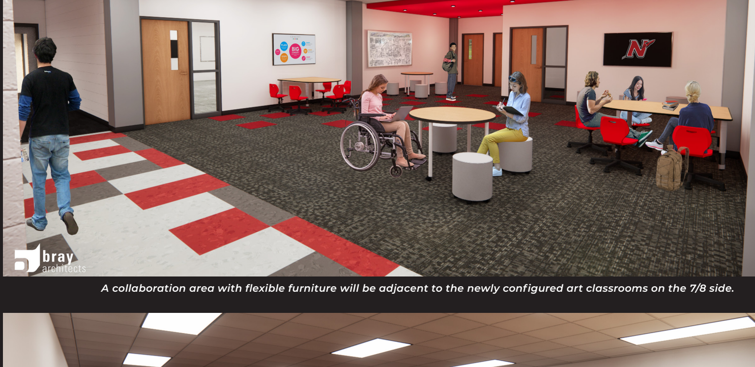
A collaboration area with flexible furniture will be adjacent to the newly configured art classrooms on the 7/8 side.