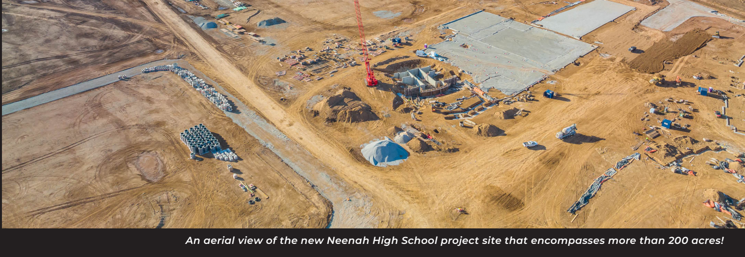
An aerial view of the new Neenah High School project site that encompasses more than 200 acres!

Below are some recent images taken at the new Neenah High School project site! As you can see, a lot of progress has already been made. For a real-time look at the project via webcam and other project updates visit the District website.