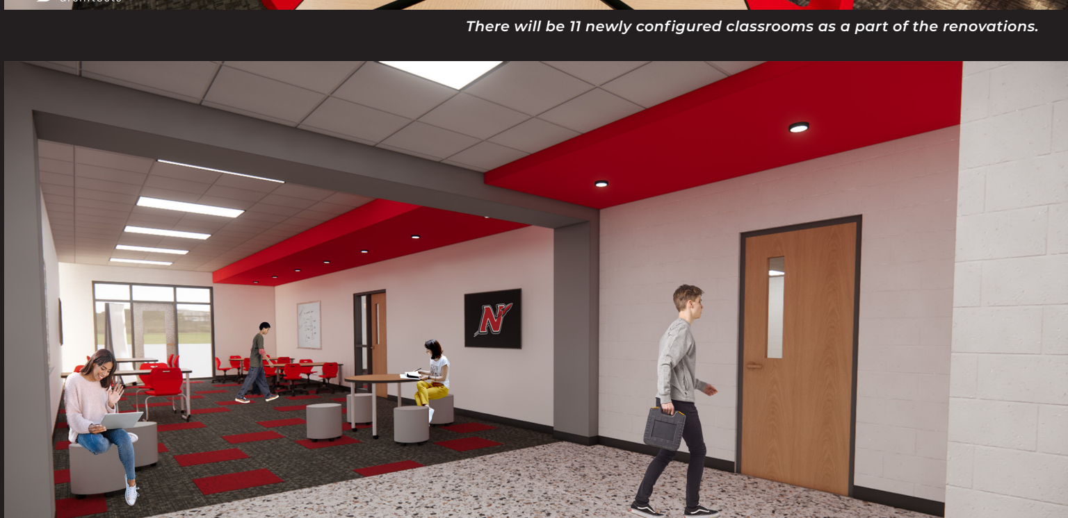
A widened hallway adjacent to new 5/6 classrooms will allow learning to spill out into collaboration space.