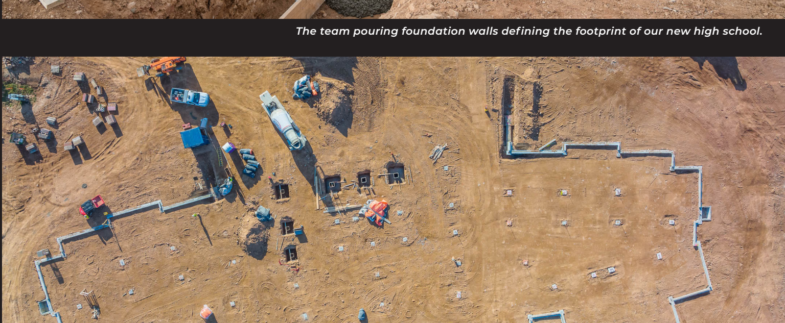
Concrete foundations outlining the unique shape of one of the educational wings.