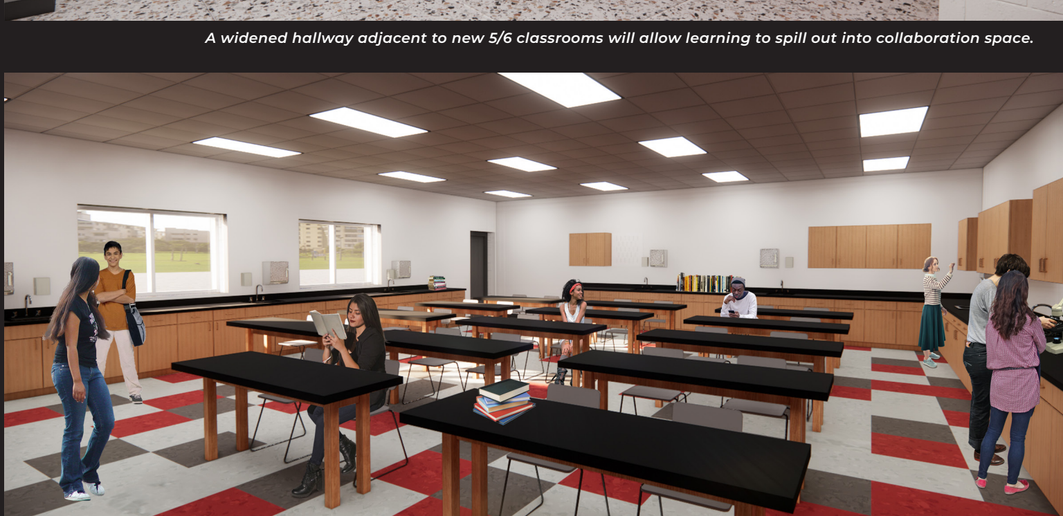
Science labs are being reconfigured to support 7/8 students.