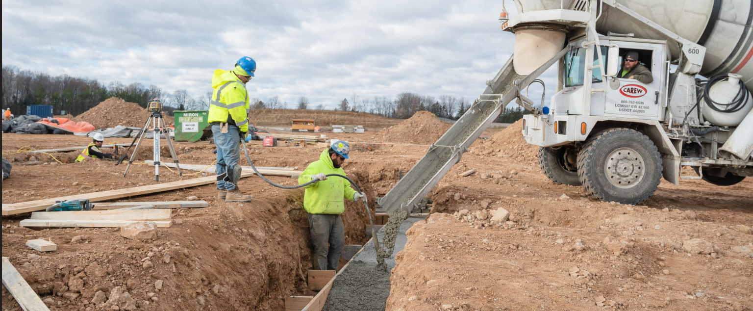
The team pouring foundation walls defining the footprint of our new high school.