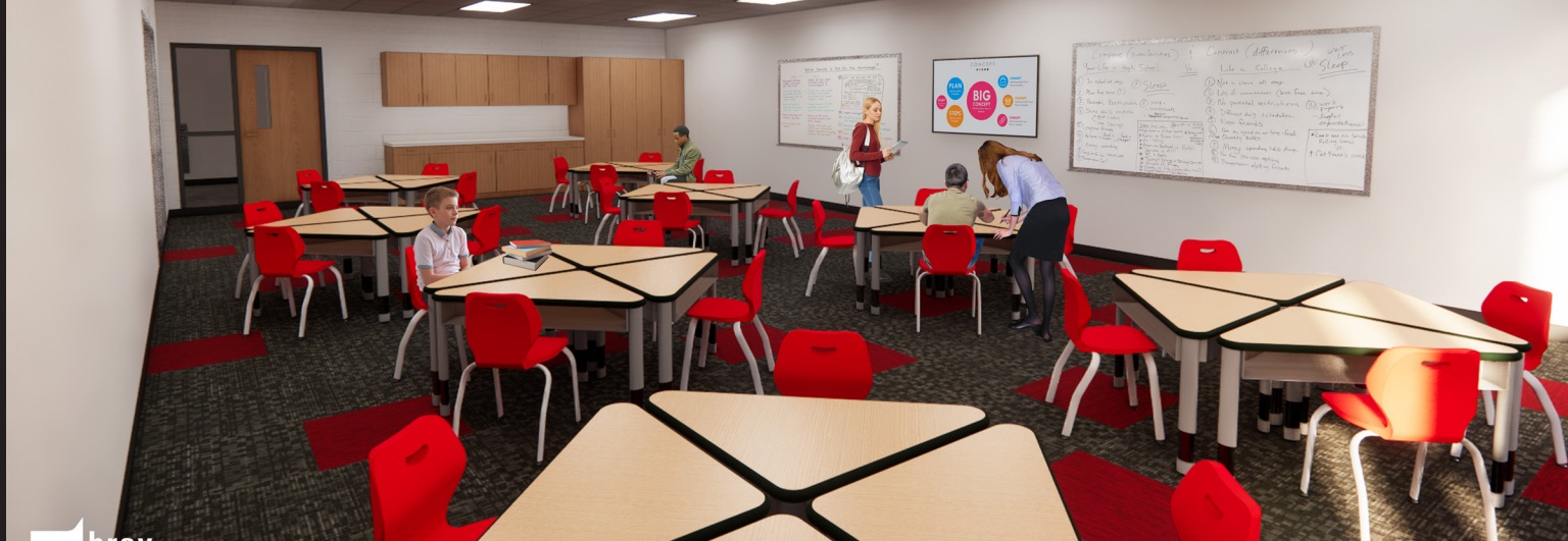
There will be 11 newly configured classrooms as a part of the renovations.