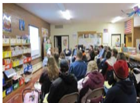
A Parent Workshop Taft Elementary