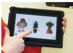
iPad and iPod for Middle School Special Needs