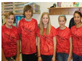
Building Leaders and Student Teamwork