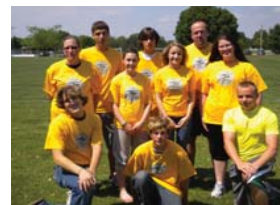
Runner's High 1/2 Marathon - NHS