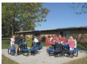
Sharing Classroom Images with a Digital Camera