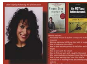
Anti-Bully Initiative, NHS SAP Jodee Blanco Presentation