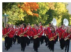
A New Tuba Middle School Band