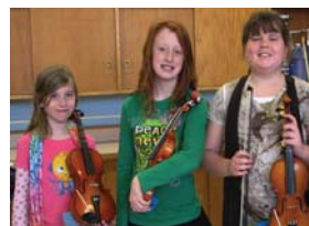
New Stringed Instruments Elementary Music