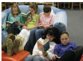
Candy's Books for Kids

please see our website for more examples & details