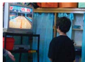
Wii Fit for a Classroom Wilson Elementary