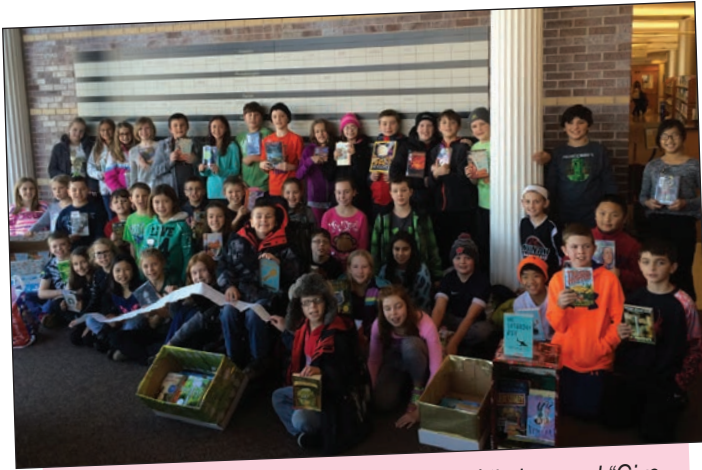
Fifth graders from Clayton Elementary held their annual "Give-A-Kid-A-Book" community service project. Clayton families and staff donated 113 new books and $682. With the donated money, the students were able to purchase an additional 144 new books to donate to Salvation Army and Boys' and Girls' Brigade.