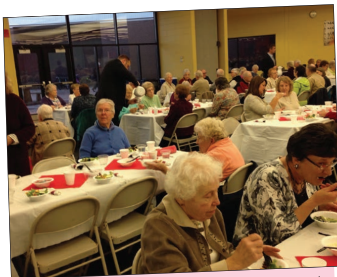
Senior citizens from throughout the community enjoyed dinner and a musical on Oct. 16 as part of Neenah High School's annual Senior Citizens Dinner Theatre. For just $7 per person, seniors were treated to dinner served by administrators and students in the high school cafeteria followed by a performance of the Fall Musical, "Footloose."