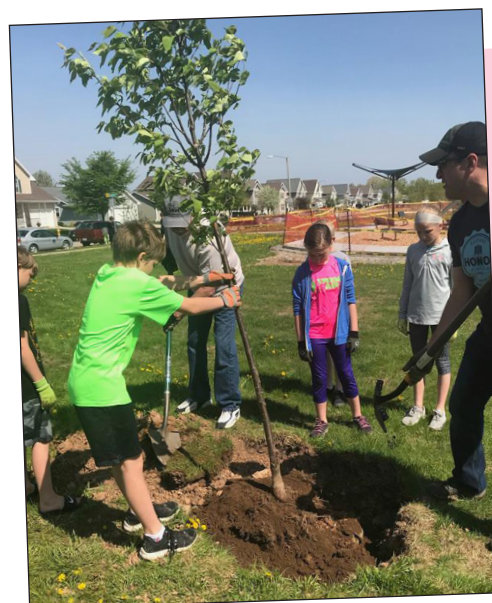
Fourth graders at Lakeview Elementary teamed with Neenah Rotary to plant 40 trees around Castle Oak Park in Neenah. Five students read poems and essays about Arbor Day and Neenah's 34th year as a Tree City USA and then all students assisted with the planting.