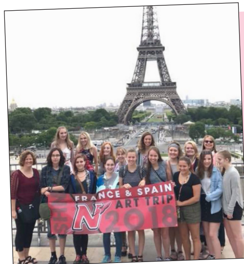
A group of 15 Neenah High School art students enjoyed a tremendous educational experience this summer with a trip to France and Spain. Students visited museums, gardens, architecture and a perfume factory while taking in a variety of live performances.