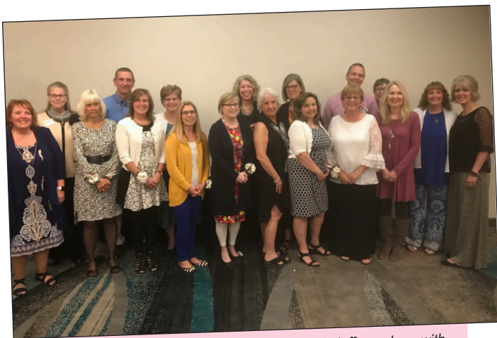
A group of 22 Neenah Joint School District staff members with a total of 507 years of experience retired following the 2017-18 school year. The group consists of 15 certified teaching staff members and seven non-certified employees.