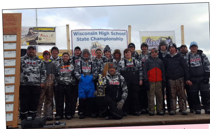
Neenah captured its first Wisconsin Interscholastic Fishing Association state championship on Feb. 18-19 in Minocqua, dethroning three-time defending champion Wisconsin Rapids. Over 90 schools have fishing teams around the state and a total of 61 teams recorded catches at the meet. Neenah's 10 members caught 269.75 inches.