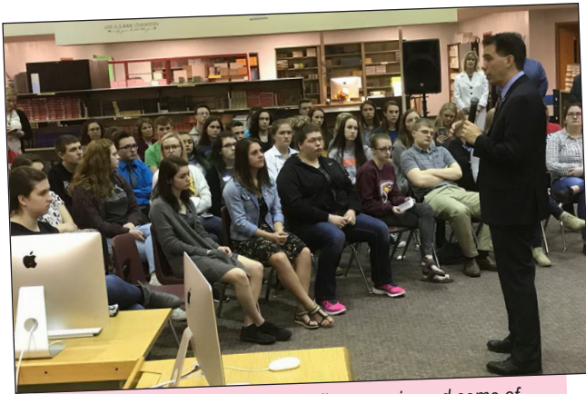
Wisconsin Governor Scott Walker experienced some of Neenah's art and music talent and spoke to a group of students about his proposed increased spending for public education during a visit to Neenah High School on April 13. It was Gov. Walker's first visit to Neenah High School since taking office.