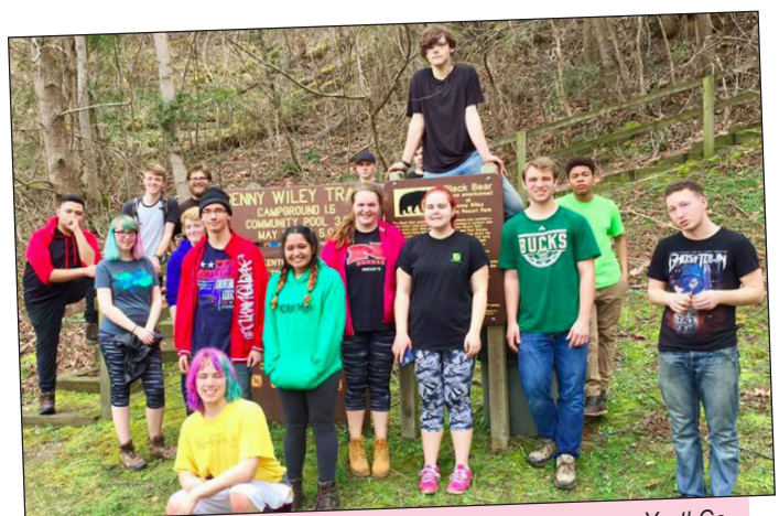
A group of 12 Neenah High School students were among a YouthGo team that worked on six homes for the elderly in rural Kentucky over spring break. Jobs consisted of building ramps for those in wheelchairs as well as replacing windows and doors on homes.

The District achieved the award's gold level, which is the third-highest of its four levels. The gold level is presented to "companies that have successfully built comprehensive worksite wellness initiatives and are demonstrating concrete results." The Neenah Joint School District is one of just 85 companies or organizations statewide which have received the honor and one of just six school districts.