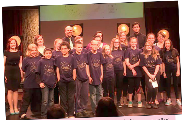
Neenah middle school theater students worked with a group called PATH from the Fox Cities Performing Arts Center. The students collaborated with professional performers from different touring acts, culminating with scripts being read by professional actors on stage.