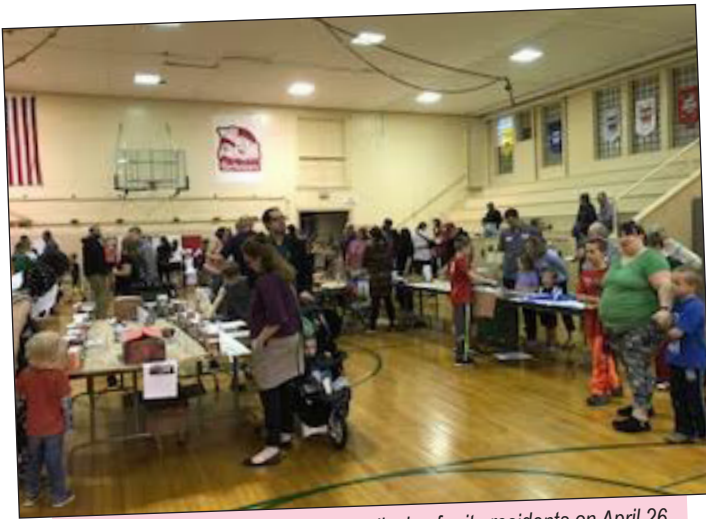
The history of Doty Island was on display for its residents on April 26 at Roosevelt and Alliance Schools as the students showed off their extensive work on the history of the island and the community in an event titled, “History in the Halls.” The event included a living museum, a model of what downtown Neenah looked like in the early 20th century and research of island homes and names. Displays also showed the changes in the school since its opening in 1923.

The grant is over a three-year period and the Board of Education has made a commitment to gradually increase funding until it is 100 percent District funded after the third year.