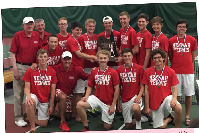
The Neenah boys tennis team finished as WIAA state runner-up this spring for the third time in the past five years with all three losses coming to Milwaukee Marquette. The Rockets also captured their 37th Fox Valley Association title in the past 39 years and extended their conference winning streak to a record 113 straight matches.