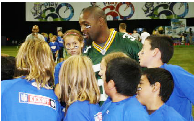
Committee members ran through a football drill with retired Packer Ahman Green as part of the Green Bay Packers Back to Football event at the Resch Center last September.

Students on the committee recently competed in a contest to create a movie showcasing how their school has been staying active during the year. Students worked in small groups to create videos using iPads. Students were lucky enough to have one video win first place and a trip to the Don Hutson center for 20 group members in May . They received a tour of Lambeau Field and worked out with Packer alumni players . See the award winning video: www.schooltube.com/video/52048bea9e4e4213a15a